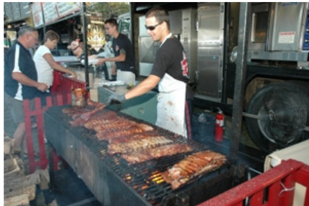
Not everyone was there for ribs!

Check out our Ribfest website, www.quinteribfest.com , for more pictures from this year's event. We will also be posting the date of next year's Ribfest very soon!